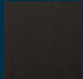
RIFT CUT COFFEE