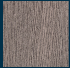
RIFT CUT SLATE